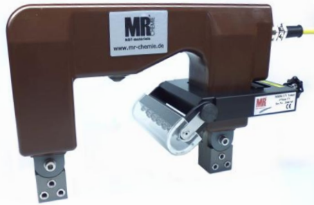
Hand yoke not part of the scope of delivery